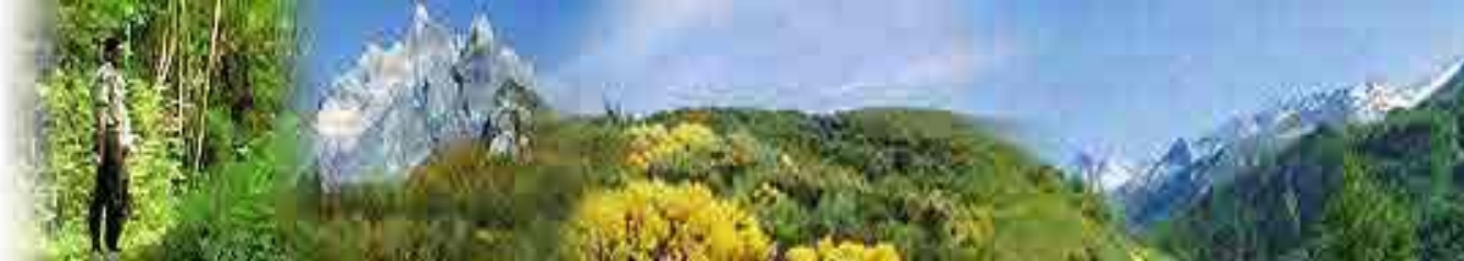
FIGURE 2 Examples of fields of professional activities in the forest sector under the seven thematic areas